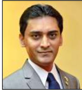
Publication Editorial Manish Desai (Digas)