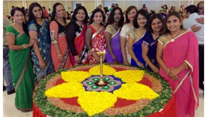
“GCA of TN celebrate Diwali”