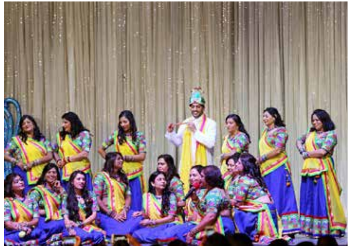
“SLPS Women’s Committee performing at Diwali Celebratoin”