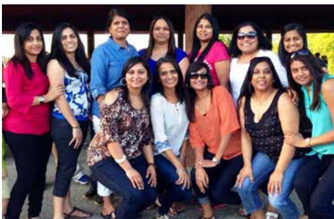
“Ladies United at GCA Picnic”