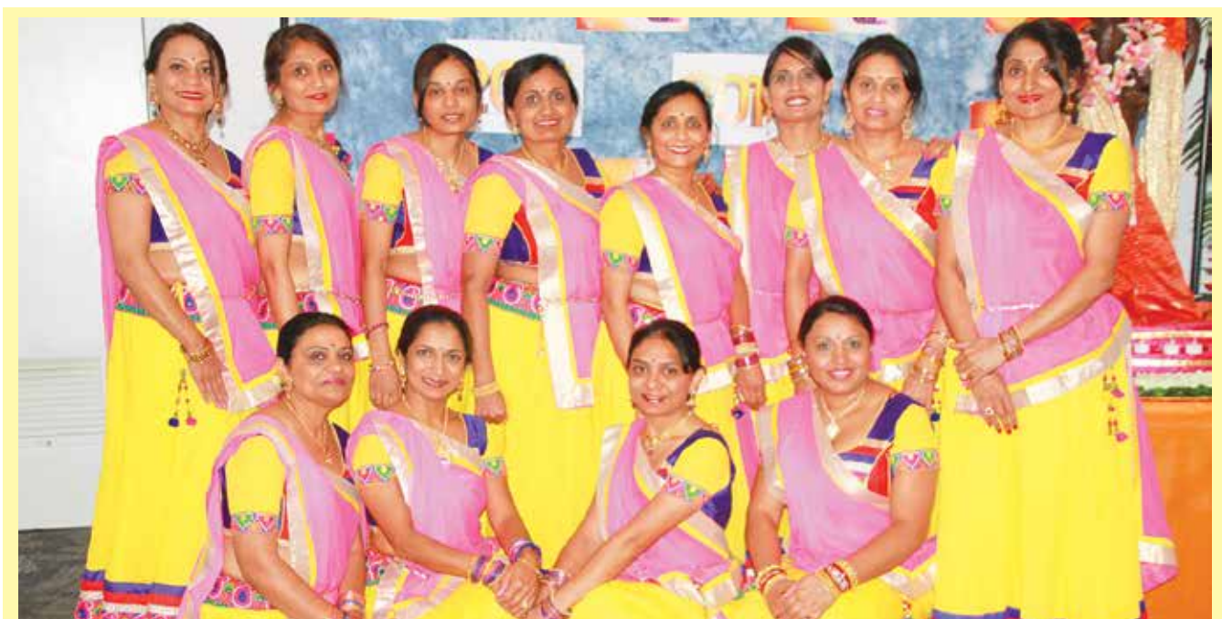
South Florida Leuva Ladies performing our Traditional Garba at local event